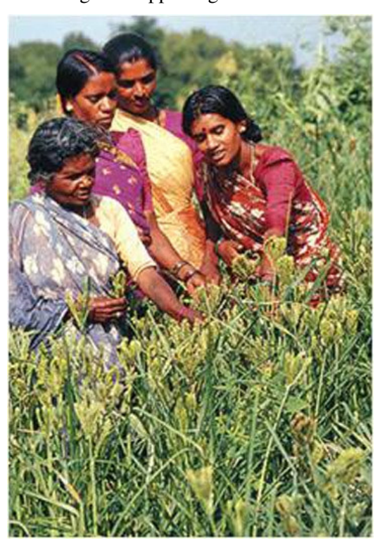
Selecting the best varieties

In this example of benefit sharing from India, in situ , or on-farm, conservation is used as a means to revive old varieties and increase seed diversity, thus rewarding and supporting farmers' contributions.