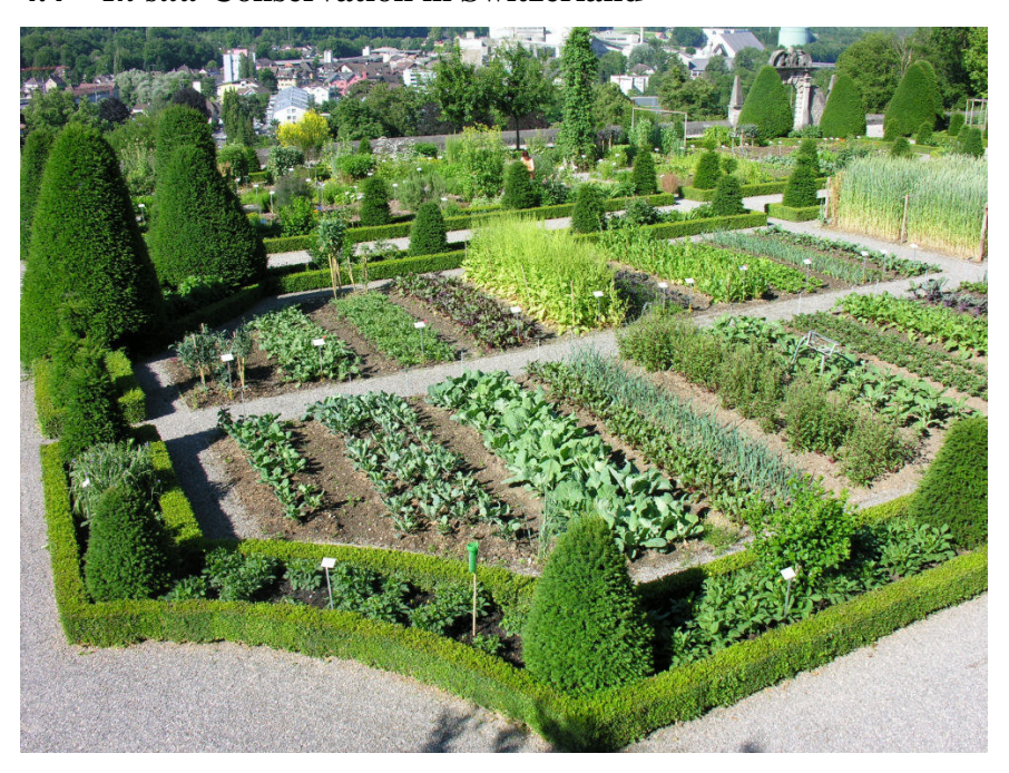
One of the many gardens where old varieties are grown

Traditional knowledge can also be protected through in situ conservation of agro-biodiversity. By ensuring that traditional varieties of plants are grown and maintained, the knowledge associated with and necessary for the full utilization of these varieties is also conserved for future generations. In addition, protecting traditional knowledge by keeping it alive in this manner is a guarantee for its continued evolution. The following example from Switzerland will show how one organization, ProSpecieRara, has been successful in maintaining an impressive collection of varieties and the related traditional knowledge by focusing on in situ conservation.