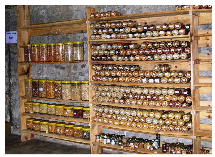
Seed Bank 2006

In this example from France, four regional projects, all carried out by regional farmers' organizations in cooperation with the National Institute for Agricultural Research (Institut National de la Recherche Agronomique, INRA), will demonstrate how participatory plant breeding combined with dynamic conservation can create a reward and support system beneficial both to the farmers involved and to the conservation of genetic resources. These four projects were all initiated by farmers to create varieties more suited to organic agricultural practices than the F1 hybrids of modern agriculture. In collaboration with INRA they succeeded in reintroducing traditional varieties and adapting them to their own needs and to the local environments. From being almost lost and mostly conserved ex situ, these old varieties and land-races are now being conserved on-farm, as well as being developed further.