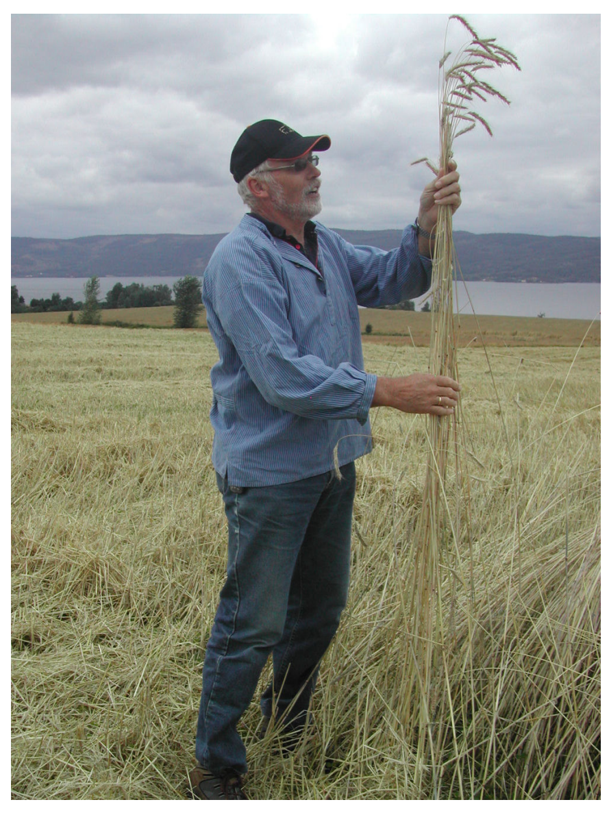
Farmer in a 'Svedjerug' field (traditional rye variety) in Norway

UPOV was adopted in 1961 to ensure that member states would acknowledge the achievements of breeders of new plant varieties by making available to them exclusive property rights for a given period. There was a need to develop a system better suited than the existing patent system to the needs of plant breeders, to ensure continued access to plant varieties for breeding purposes. Therefore wide exemptions were to be allowed from the property rights for breeders and also for farmers. The Convention on which UPOV is based entered into force in 1968 and has been revised several times, each time with increasingly restricted exemptions for breeders and farmers. Today most member countries adhere to either the 1978 Act or the 1991 Act of UPOV. Norway is member of UPOV based on the 1978 Act and upholds its right to continue as a member on the basis of that Act.