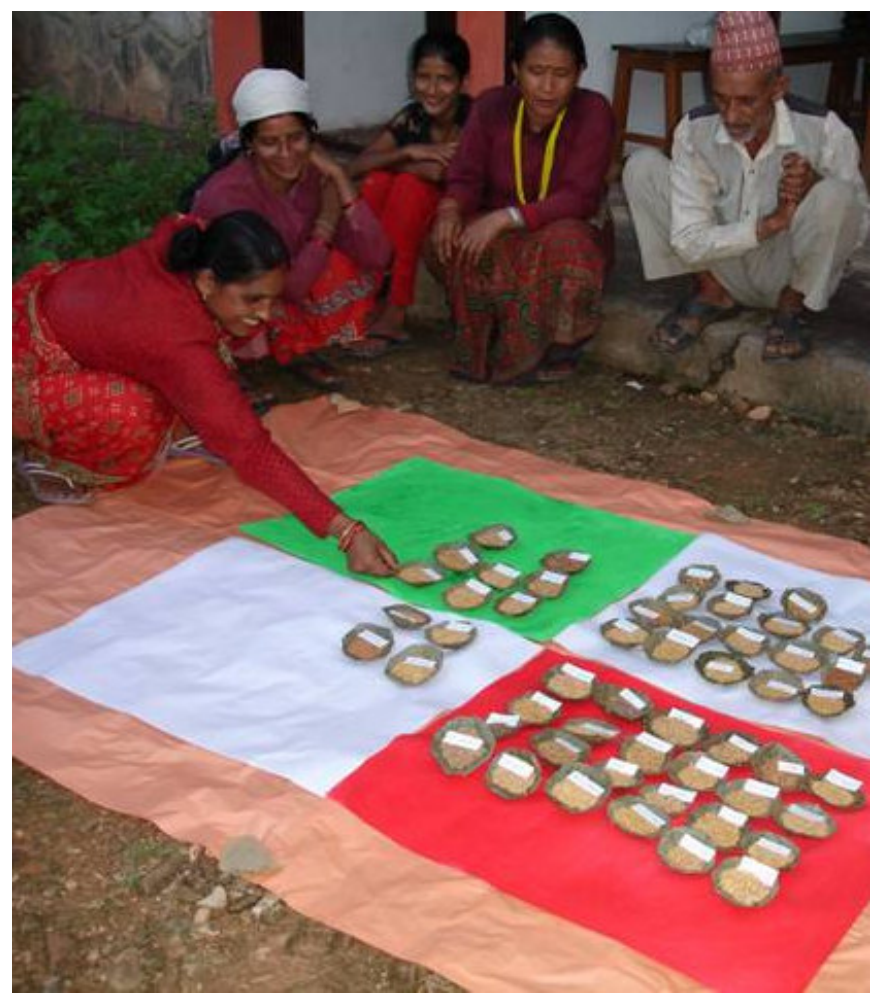
Farmers participating in a LI-BIRD project

technological changes and greater integration into the market economy. This has resulted in a gradual loss of agricultural biodiversity and a need to restore traditional knowledge and conserve biodiversity.