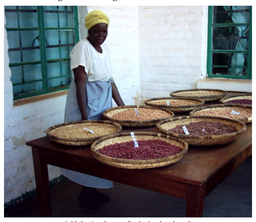
A Malawian farmer displaying local seeds

To ensure the participation of farmers in relevant decision making processes it is often necessary to increase the awareness of both farmers and decision makers regarding the various issues related to Farmers' Rights and their impact on agricultural production. As was mentioned in