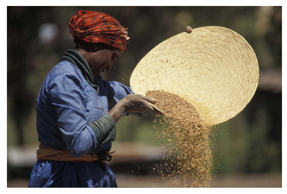
African farmer