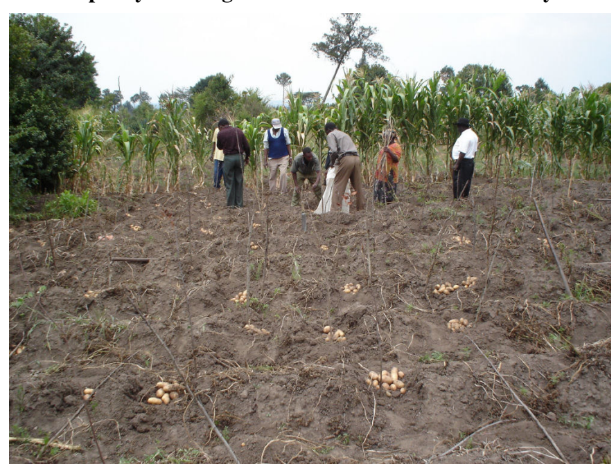
Harvesting selected plants one by one

The following example of benefit sharing from Kenya demonstrates how information sharing and education of farmers can yield positive results. By spreading the knowledge of how to select the best seed potatoes through farmer group training, potato yields in this area of Kenya have increased substantially, thereby rewarding farmers' efforts.