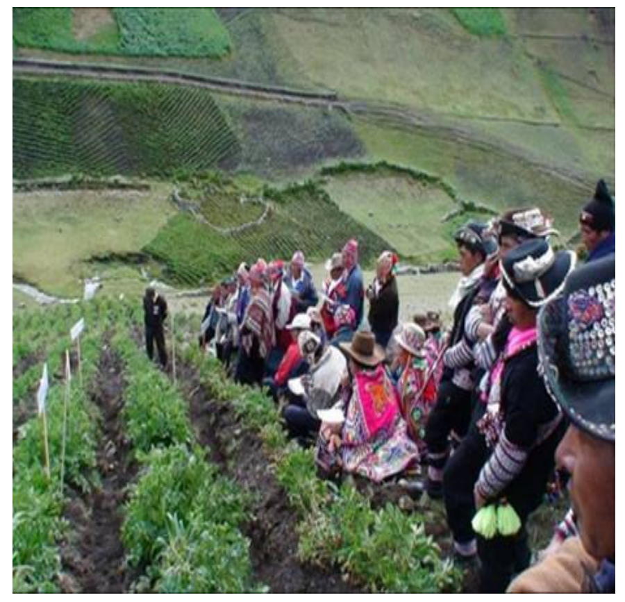
The Peruvian Potato Park

Even though most of the potatoes produced in the world today belong to one single species with a few varieties, estimates suggest that there exist approximately 6,500 potato varieties worldwide. It is only in the Andes region, the place of origin for the potato, that a wide diversity of species and varieties is still cultivated and used. This enormous diversity represents a gene reservoir of inestimable value for global food security. Even in this centre of diversity, however, there has been a dramatic decline in the cultivation of traditional varieties in recent decades, and some are on the verge of disappearing.