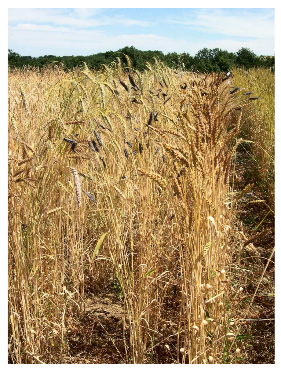
Old wheat varieties

All these four projects from different regions of France have managed to spread awareness of the demise of genetic diversity and the necessity of continued cultivation and in situ conservation. Through participatory plant breeding, they have helped to re-introduce some of the diversity that had vanished from the fields. Varieties that had disappeared from the countryside and were mostly or only found in ex situ collections are now being cultivated on-farm. This success came about as farmers and their organizations joined forces with the scientists of INRA and bred varieties suited to organic farming and in other ways adapted to the needs of the farmers. Farmers have organized themselves and are collaborating in seed production, and experiences and knowledge are being exchanged. Another successful aspect of these projects has been the marketing of the produce, with the consumers in some cases being involved in the testing to ensure that the products match the preferences of the market.